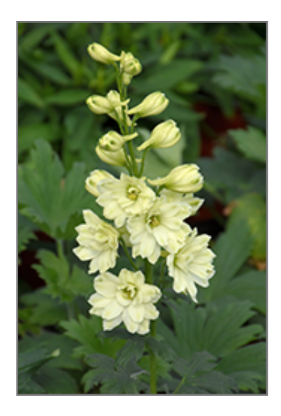
New Millennium Mini Stars Larkspur flowers