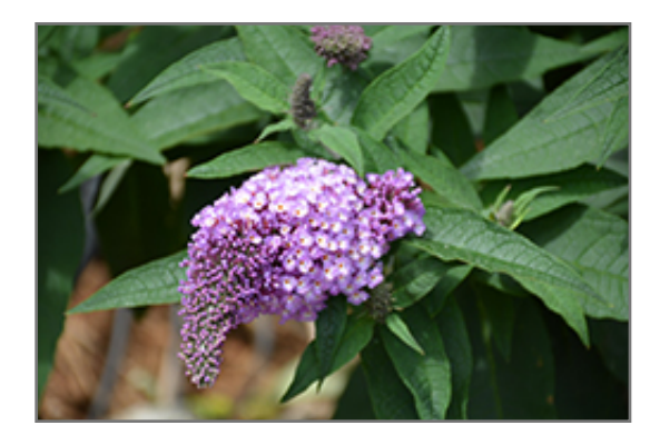
Pugster Amethyst Butterfly Bush flowers