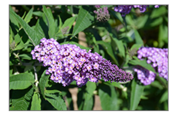
Pugster Amethyst Butterfly Bush flowers

Pugster Amethyst Butterfly Bush is an open multi-stemmed deciduous shrub with a more or less rounded form. Its average texture blends into the landscape, but can be balanced by one or two finer or coarser trees or shrubs for an effective composition.