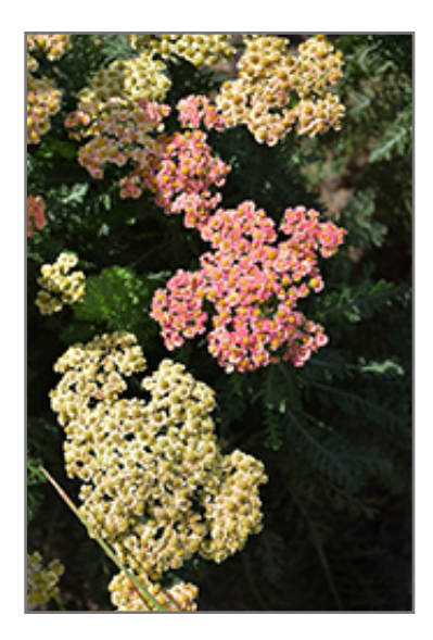
Firefly Peach Sky Yarrow flowers

Light peachy-orange flowers that age to yellow illuminate the garden in summer; a taller selection with an upright habit and strong stems; excellent for xeriscaping and hot, sunny, dry locations in the garden