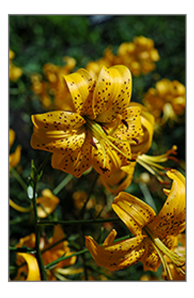
Golden Princess Lily flowers

Golden Princess Lily features bold nodding gold trumpet-shaped flowers with brown spots at the ends of the stems in early summer. The flowers are excellent for cutting. Its narrow leaves remain green in colour throughout the season.