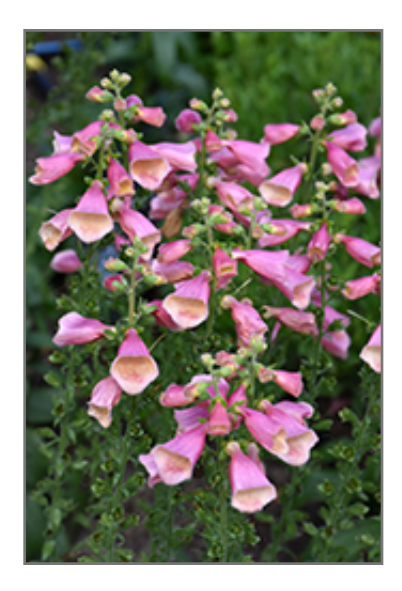
Arctic Fox Rose Foxglove flowers