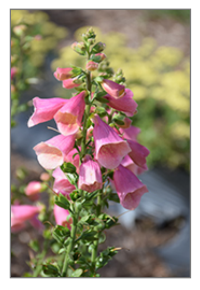
Arctic Fox Rose Foxglove flowers

This plant will require occasional maintenance and upkeep, and is best cleaned up in early spring before it resumes active growth for the season. It is a good choice for attracting bees, butterflies and hummingbirds to your yard, but is not particularly attractive to deer who tend to leave it alone in favor of tastier treats. Gardeners should be aware of the following characteristic(s) that may warrant special consideration;