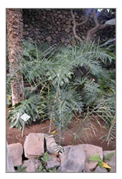
Baby Queen Palm

This tropical plant performs well in both full sun and full shade. It does best in average to evenly moist conditions, but will not tolerate standing water. It is not particular as to soil pH, but grows best in rich soils. It is somewhat tolerant of urban pollution. This species is not originally from North America..