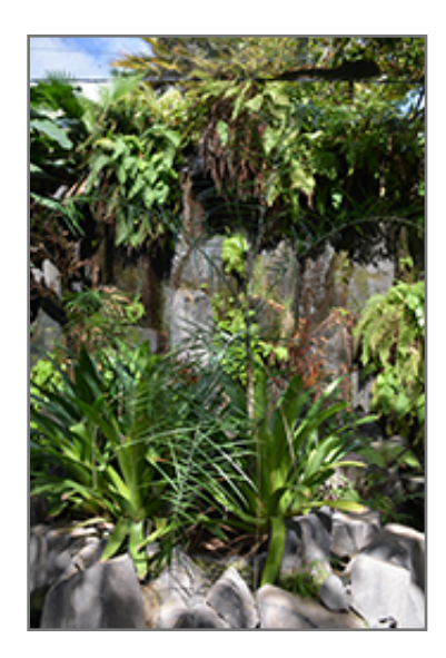
Baby Queen Palm