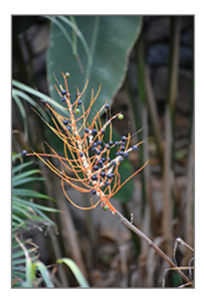
Baby Queen Palm fruit

Baby Queen Palm is a fine choice for the yard, but it is also a good selection for planting in outdoor pots and containers. Because of its height, it is often used as a 'thriller' in the 'spiller-thriller-filler' container combination; plant it near the center of the pot, surrounded by smaller plants and those that spill over the edges. It is even sizeable enough that it can be grown alone in a suitable container. Note that when grown in a container, it may not perform exactly as indicated on the tag - this is to be expected. Also note that when growing plants in outdoor containers and baskets, they may require more frequent waterings than they would in the yard or garden. Be aware that in our climate, most plants cannot be expected to survive the winter if left in containers outdoors, and this plant is no exception. Contact our experts for more information on how to protect it over the winter months.