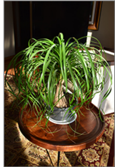
Pony Tail Palm in full

When grown indoors, Pony Tail Palm can be expected to grow to be about 7 feet tall at maturity, with a spread of 4 feet. It grows at a slow rate, and under ideal conditions can be expected to live for approximately 80 years. This houseplant will do well in a location that gets either direct or indirect sunlight, although it will usually require a more brightly-lit environment than what artificial indoor lighting alone can provide. It prefers dry to average moisture levels with very well-drained soil, and may die if left in standing water for any length of time. This plant should be watered when the surface of the soil gets dry, and will need watering approximately once each week. Be aware that your particular watering schedule may vary depending on its location in the room, the pot size, plant size and other conditions; if in doubt, ask one of our experts in the store for advice. It is not particular as to soil pH, but grows best in sandy soil. Contact the store for specific recommendations on pre-mixed potting soil for this plant.