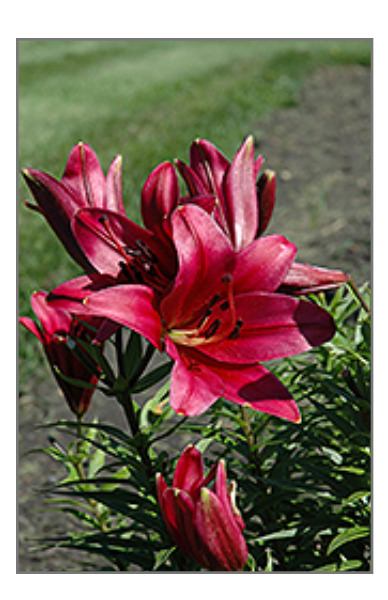
Flaming Belles Lily flowers

Flaming Belles Lily features bold fragrant fuchsia trumpet-shaped flowers at the ends of the stems in early summer. The flowers are excellent for cutting. Its narrow leaves remain green in colour throughout the season.