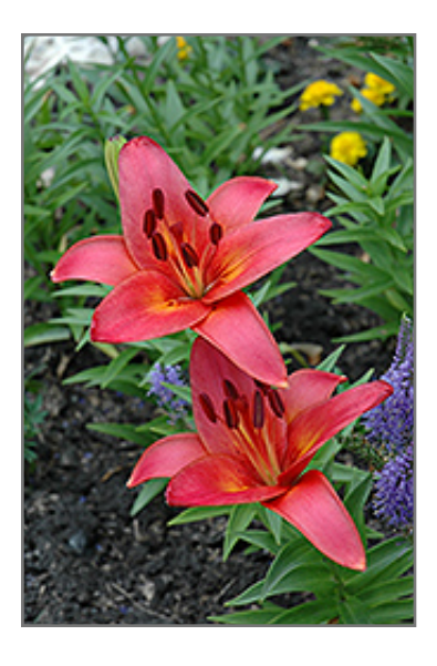
Eurogold Lily flowers

Eurogold Lily features bold rose trumpet-shaped flowers with gold centers at the ends of the stems in early summer. The flowers are excellent for cutting. Its narrow leaves remain green in colour throughout the season.