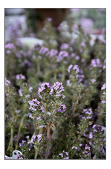
Spicy Orange Thyme flowers

A highly desired ground cover, this tough plant features attractive, soft lavender flowers in summer held over a dense mound of very fine extremely fragrant foliage that smells like oranges when crushed, can take light foot traffic; needs full sun