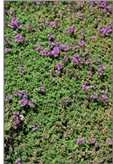
Creeping Thyme in bloom

Creeping Thyme is recommended for the following landscape applications;