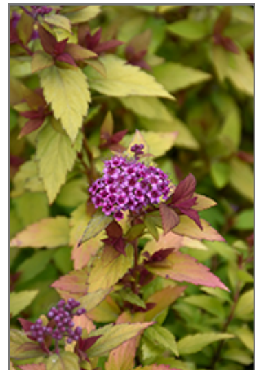
Poprocks Rainbow Fizz Spirea flowers