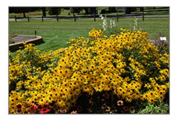
Glitters Like Gold Coneflower in bloom

This is a relatively low maintenance plant, and should be cut back in late fall in preparation for winter. It is a good choice for attracting butterflies to your yard, but is not particularly attractive to deer who tend to leave it alone in favor of tastier treats. It has no significant negative characteristics.