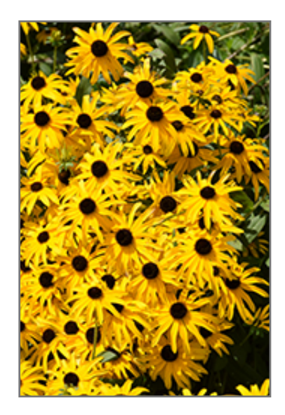
Glitters Like Gold Coneflower flowers

Glitters Like Gold Coneflower is an herbaceous perennial with an upright spreading habit of growth. Its medium texture blends into the garden, but can always be balanced by a couple of finer or coarser plants for an effective composition.