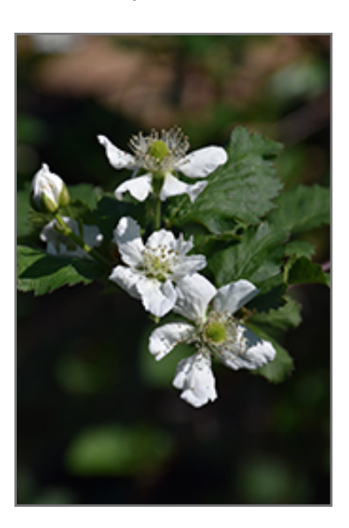
Natchez Thornless Blackberry flowers