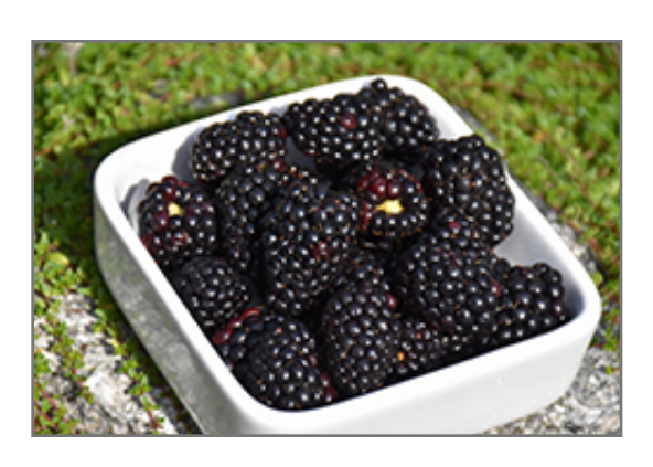
Natchez Thornless Blackberry fruit

This is an open multi-stemmed deciduous shrub with a spreading, ground-hugging habit of growth. Its relatively coarse texture can be used to stand it apart from other landscape plants with finer foliage. This is a high maintenance plant that will require regular care and upkeep. Each spring, cut back all dead and two-year old canes to the ground, leaving only last year's growth standing. It is a good choice for attracting birds to your yard. Gardeners should be aware of the following characteristic(s) that may warrant special consideration;