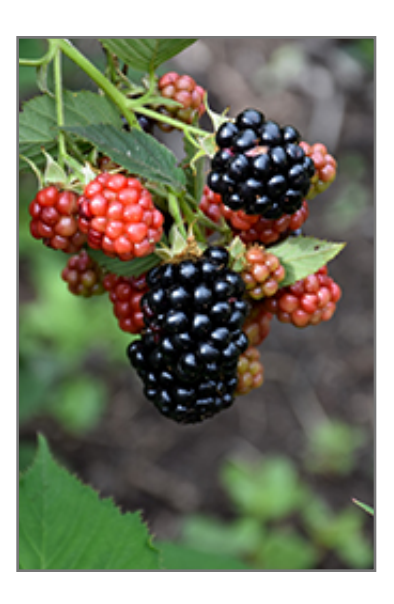
Natchez Thornless Blackberry fruit