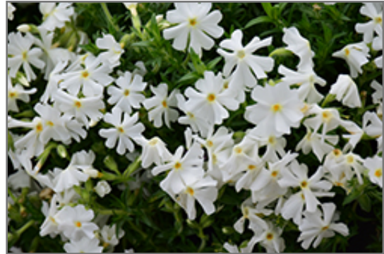
Early Spring White Moss Phlox flowers