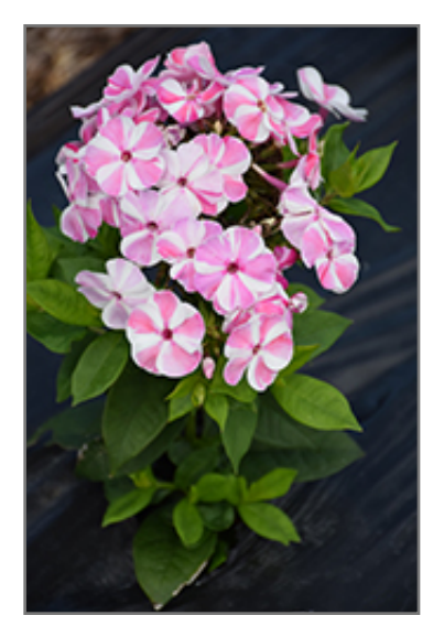
Bambini Candy Crush Dwarf Garden Phlox flowers

Long lasting, fragrant candy pink flowers with dazzling white stripes from early summer until fall; excellent compact branching, with flowers in abundance all season; suitable for containers, perennial borders or mass planting; good mildew resistance