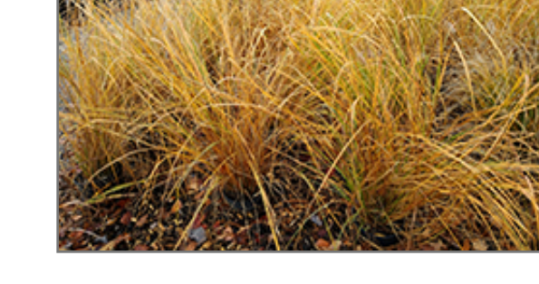
Foxtrot Fountain Grass in fall

Foxtrot Fountain Grass has masses of beautiful plumes of pink flowers with purple overtones rising above the foliage from mid to late summer, which are most effective when planted in groupings. The tan seed heads are carried on showy plumes displayed in abundance from early fall to mid winter. Its grassy leaves are green in colour. As an added bonus, the foliage turns gorgeous shades of yellow, tan and gold in the fall.