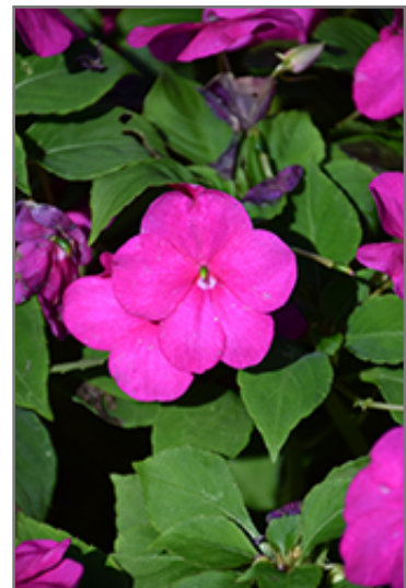
Beacon Violet Shades Impatiens flowers