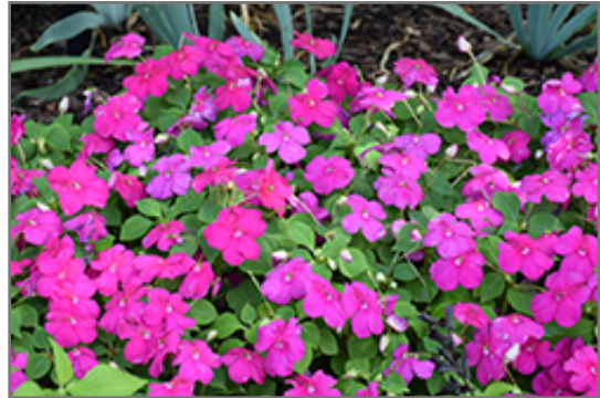
Beacon Violet Shades Impatiens flowers

Beacon Violet Shades Impatiens is recommended for the following landscape applications;