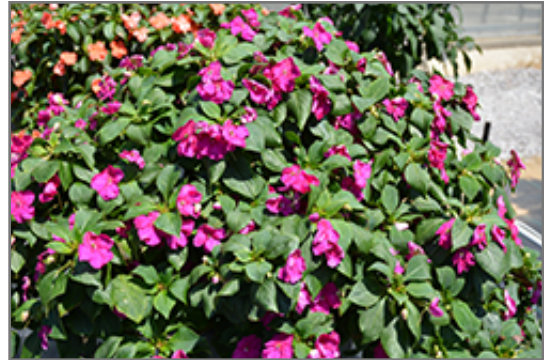
Beacon Violet Shades Impatiens in bloom

Beacon Violet Shades Impatiens will grow to be about 15 inches tall at maturity, with a spread of 12 inches. When grown in masses or used as a bedding plant, individual plants should be spaced approximately 8 inches apart. Its foliage tends to remain dense right to the ground, not requiring facer plants in front. This fast-growing annual will normally live for one full growing season, needing replacement the following year.