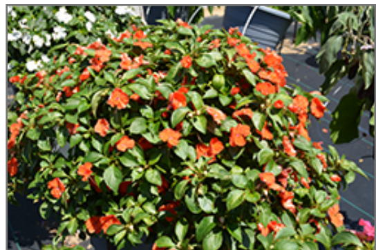
Beacon Orange Impatiens in bloom