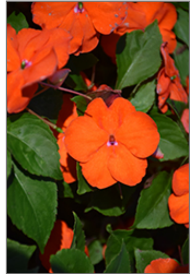
Beacon Orange Impatiens flowers

Beacon Orange Impatiens is recommended for the following landscape applications;