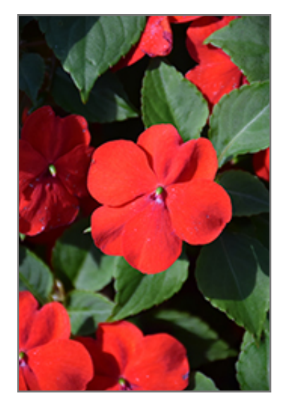
Beacon Bright Red Impatiens flowers

This plant will require occasional maintenance and upkeep, and should not require much pruning, except when necessary, such as to remove dieback. It has no significant negative characteristics.