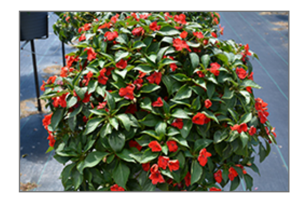
Beacon Bright Red Impatiens in bloom

Beacon Bright Red Impatiens is recommended for the following landscape applications;