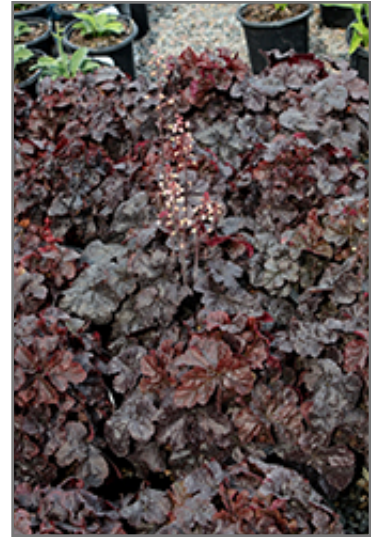
Onyx Foamy Bells