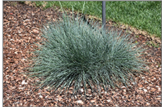
Cool As Ice Blue Fescue

Cool As Ice Blue Fescue is recommended for the following landscape applications;