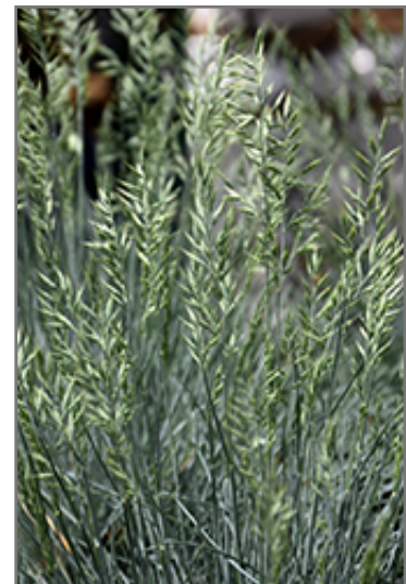
Cool As Ice Blue Fescue flowers