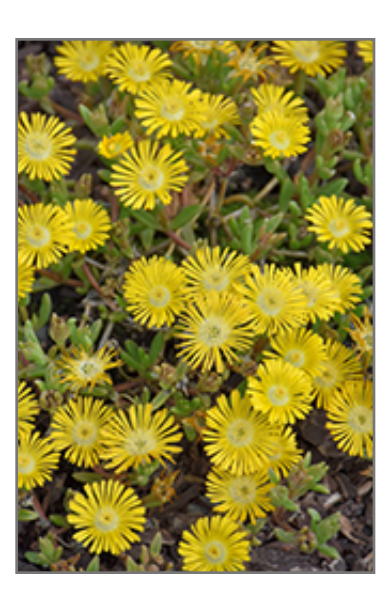
Wheels of Wonder Golden Wonder Ice Plant flowers

A low growing succulent, native to South Africa but amazingly hardy in North America; dazzling yellow daisy-like flowers with white centers; green foliage has burgundy overtones in fall; perfect for xeriscapes, rock gardens, screes and sandy soils