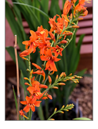
Emily McKenzie Crocosmia flowers

Graceful, arching sprays of bright orange, star-like blooms with crimson throats rise above erect, sword-shaped foliage; attracts hummingbirds; best performance in full-sun; plant corms in spring if starting this plant yourself, can be lifted in fall