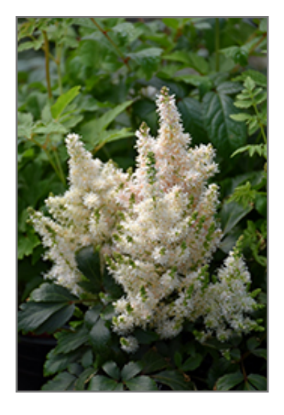
Younique Salmon Astilbe flowers