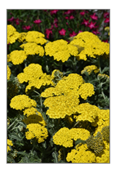
Little Moonshine Yarrow flowers

This plant will require occasional maintenance and upkeep, and is best cleaned up in early spring before it resumes active growth for the season. It is a good choice for attracting bees, butterflies and hummingbirds to your yard, but is not particularly attractive to deer who tend to leave it alone in favor of tastier treats. Gardeners should be aware of the following characteristic(s) that may warrant special consideration;