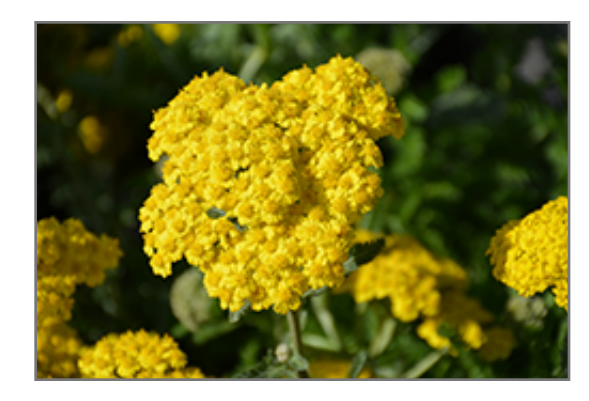
Little Moonshine Yarrow flowers