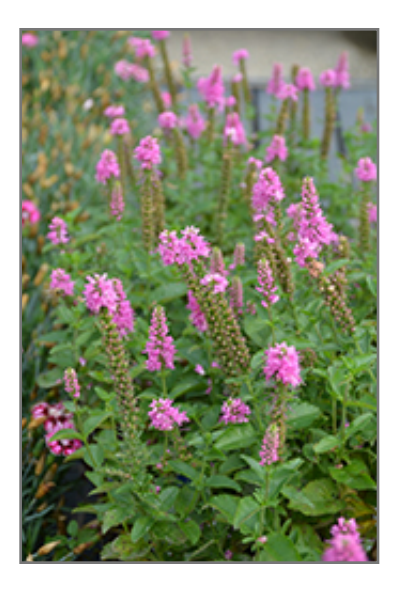
Ronica Fuchsia Speedwell flowers