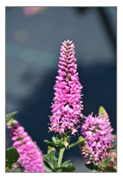
Ronica Fuchsia Speedwell flowers

Ronica Fuchsia Speedwell is recommended for the following landscape applications;