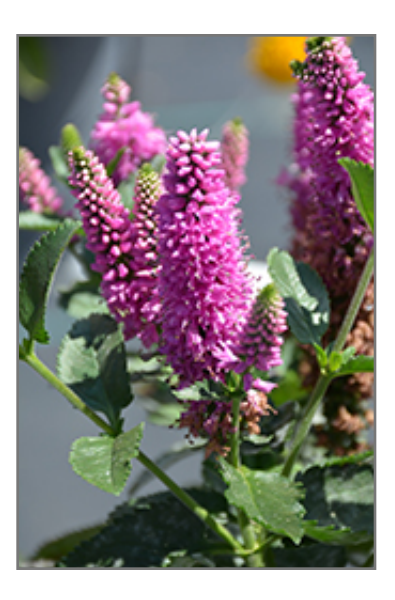
Ronica Fuchsia Speedwell flowers

This plant does best in full sun to partial shade. It prefers dry to average moisture levels with very well-drained soil, and will often die in standing water. It is considered to be drought-tolerant, and thus makes an ideal choice for a low-water garden or xeriscape application. It is not particular as to soil pH, but grows best in sandy soils, and is able to handle environmental salt. It is highly tolerant of urban pollution and will even thrive in inner city environments. This particular variety is an interspecific hybrid. It can be propagated by division; however, as a cultivated variety, be aware that it may be subject to certain restrictions or prohibitions on propagation.