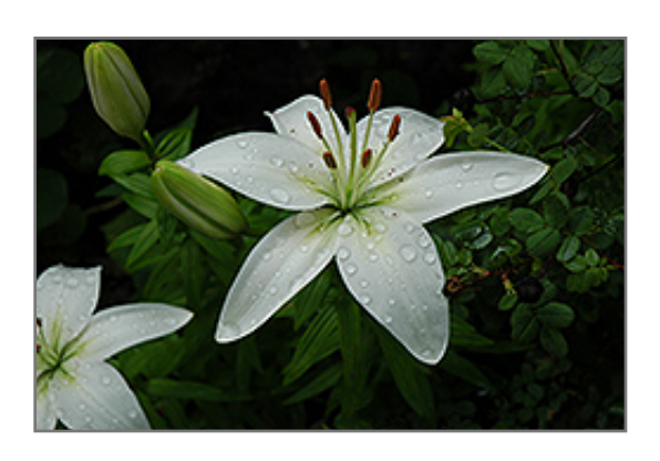
Colibri Lily flowers