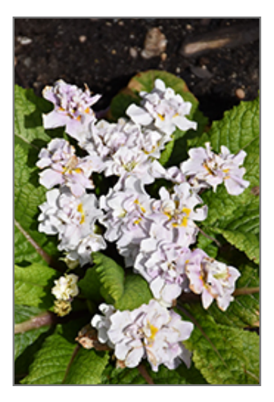
BELARINA PINK ICE Primrose flowers