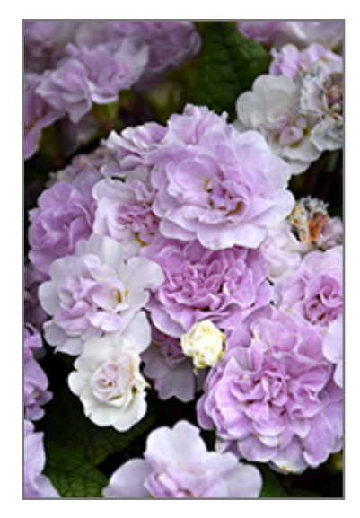
BELARINA PINK ICE Primrose flowers

BELARINA PINK ICE Primrose is recommended for the following landscape applications;