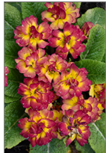
BELARINA NECTARINE Primrose flowers