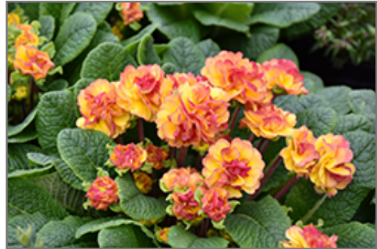
BELARINA NECTARINE Primrose flowers

BELARINA NECTARINE Primrose is recommended for the following landscape applications;