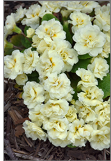
BELARINA CREAM Primrose flowers

BELARINA CREAM Primrose is recommended for the following landscape applications;