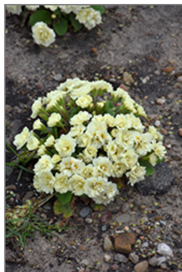
BELARINA CREAM Primrose in bloom