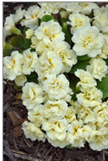
BELARINA CREAM Primrose flowers

BELARINA CREAM Primrose is recommended for the following landscape applications;