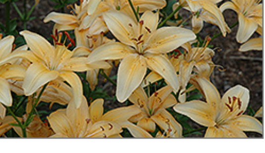
Butterscotch Lily flowers

Butterscotch Lily will grow to be about 30 inches tall at maturity, with a spread of 18 inches. When grown in masses or used as a bedding plant, individual plants should be spaced approximately 14 inches apart. It tends to be leggy, with a typical clearance of 1 foot from the ground, and should be underplanted with lower-growing perennials. It grows at a fast rate, and under ideal conditions can be expected to live for approximately 10 years. As an herbaceous perennial, this plant will usually die back to the crown each winter, and will regrow from the base each spring. Be careful not to disturb the crown in late winter when it may not be readily seen!