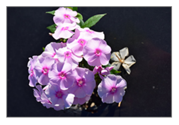
Sweet Summer Sensation Garden Phlox flowers

Sweet Summer Sensation Garden Phlox is recommended for the following landscape applications: