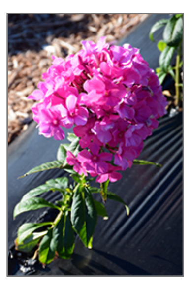
Sweet Summer Dream Garden Phlox flowers

Exceptional early blooms of vibrant rose flowers with orange overtones and hot pink centers; plants are well branched, with a long flowering period, suitable for containers or small perennial borders; strong disease resistance