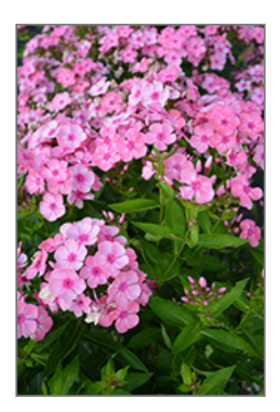
Sweet Summer Candy Garden Phlox flowers

Exceptional early blooms of vibrant rose flowers with hot pink centers and white flares, on compact, well branched plants; has a long flowering period, suitable for containers or small perennial borders; strong disease resistance