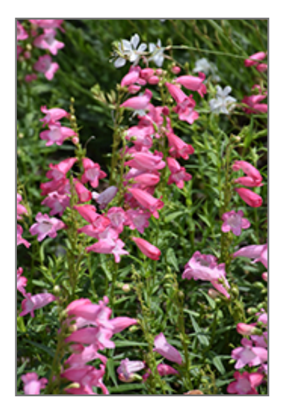
Quartz Rose Beard Tongue flowers

Plant Height: 18 inches Flower Height: 24 inches Spread: 24 inches Spacing: 18 inches Sunlight: O O Hardiness Zone: 6b Other Names: Beardtongue Group/Class: Quartz Series