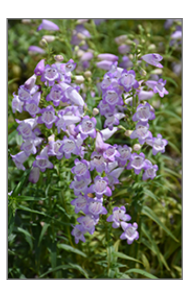
Quartz Amethyst Beard Tongue flowers

A vigorous, sturdy and upright selection, with large, lilac colored flowers with striped white throats; re-blooms throughout the season; stunning as a complement to other perennials; great for borders, along walkways, or in containers