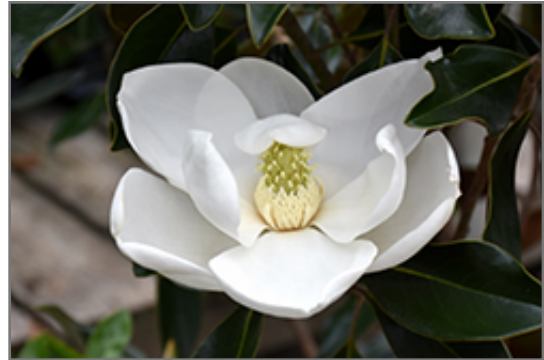
Majestic Beauty Magnolia flowers

This is a relatively low maintenance tree, and should only be pruned after flowering to avoid removing any of the current season's flowers. Deer don't particularly care for this plant and will usually leave it alone in favor of tastier treats. It has no significant negative characteristics.