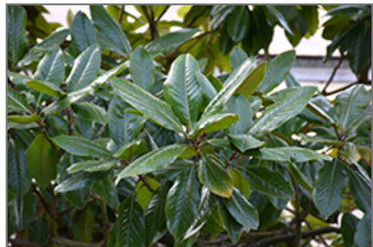
Majestic Beauty Magnolia foliage