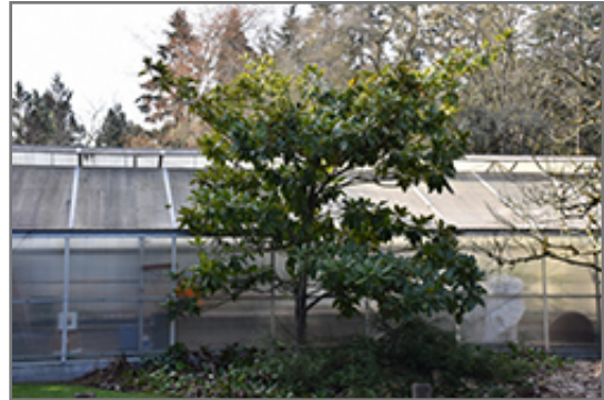
Majestic Beauty Magnolia

This tree does best in full sun to partial shade. It requires an evenly moist well-drained soil for optimal growth, but will die in standing water. It is not particular as to soil type, but has a definite preference for acidic soils. It is somewhat tolerant of urban pollution, and will benefit from being planted in a relatively sheltered location. Consider applying a thick mulch around the root zone in winter to protect it in exposed locations or colder microclimates. This is a selection of a native North American species.