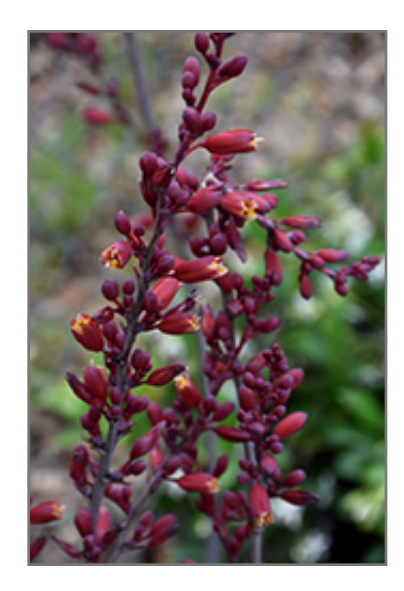
Desert Dusk Red Yucca flowers

Desert Dusk Red Yucca is recommended for the following landscape applications;