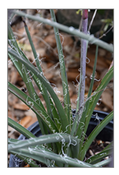
Desert Dusk Red Yucca foliage