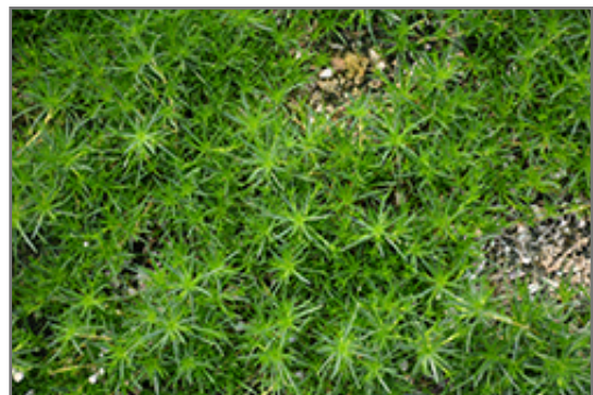
Irish Moss foliage