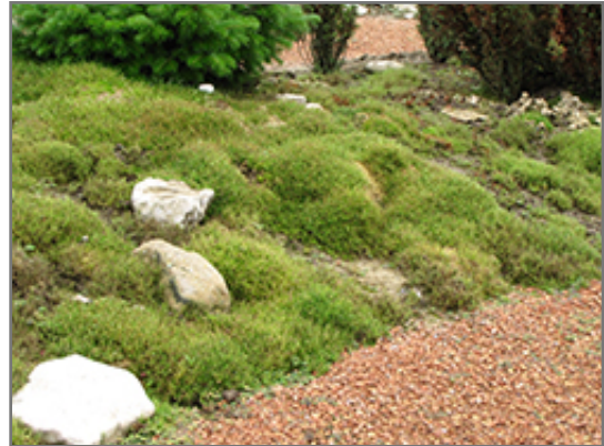
Irish Moss

This plant does best in full sun to partial shade. It does best in average to evenly moist conditions, but will not tolerate standing water. It is not particular as to soil type or pH. It is highly tolerant of urban pollution and will even thrive in inner city environments. Consider covering it with a thick layer of mulch in winter to protect it in exposed locations or colder microclimates. This species is not originally from North America. It can be propagated by division.