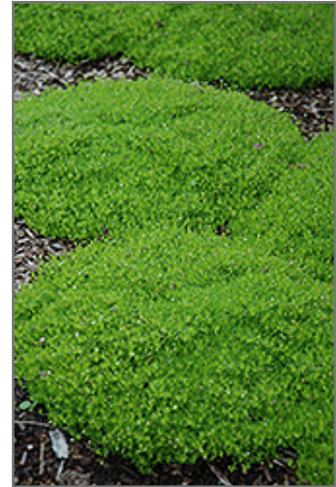
Irish Moss