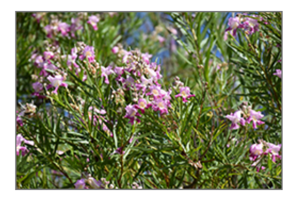
Timeless Beauty Desert Willow flowers