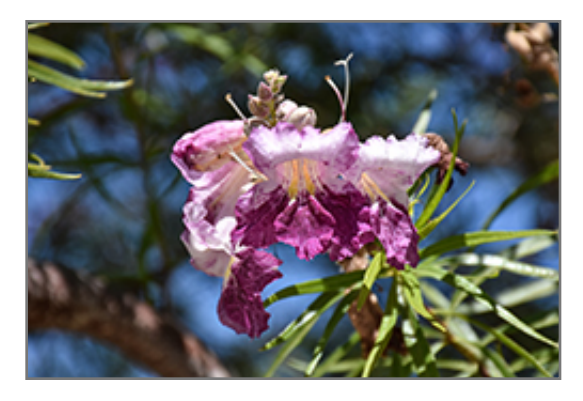
Timeless Beauty Desert Willow flowers

Timeless Beauty Desert Willow is a multi-stemmed deciduous tree with an upright spreading habit of growth. Its relatively fine texture sets it apart from other landscape plants with less refined foliage.