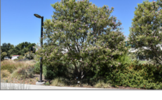
Timeless Beauty Desert Willow in bloom

Timeless Beauty Desert Willow will grow to be about 20 feet tall at maturity, with a spread of 20 feet. It has a low canopy with a typical clearance of 3 feet from the ground, and is suitable for planting under power lines. It grows at a medium rate, and under ideal conditions can be expected to live for 50 years or more.