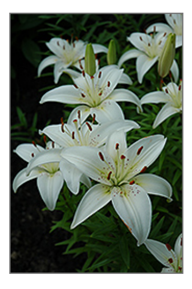
Antarctica Lily flowers

Antarctica Lily features bold white trumpet-shaped flowers with light green throats at the ends of the stems in early summer. The flowers are excellent for cutting. Its narrow leaves remain green in colour throughout the season.