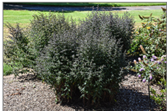
Prince Calico Aster