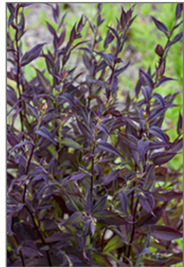
Lady In Black Calico Aster