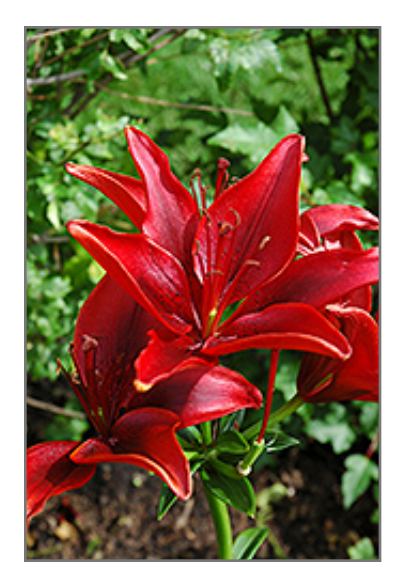
America Lily flowers

America Lily features bold ruby-red trumpet-shaped flowers at the ends of the stems in early summer. The flowers are excellent for cutting. Its narrow leaves remain green in colour throughout the season.