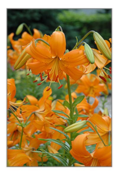
Alexis Lily flowers

Alexis Lily features bold nodding orange trumpet-shaped flowers at the ends of the stems in early summer. The flowers are excellent for cutting. Its narrow leaves remain green in colour throughout the season.