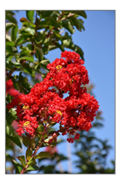
Miss Frances Crapemyrtle flowers