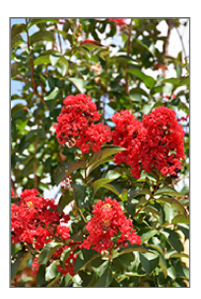
Miss Frances Crapemyrtle flowers