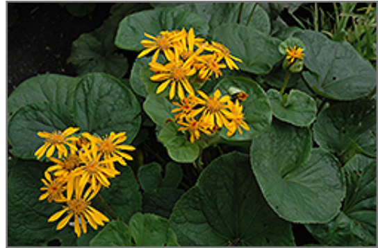
Desdemona Rayflower flowers

Desdemona Rayflower will grow to be about 24 inches tall at maturity extending to 3 feet tall with the flowers, with a spread of 24 inches. It grows at a medium rate, and under ideal conditions can be expected to live for approximately 20 years. As an herbaceous perennial, this plant will usually die back to the crown each winter, and will regrow from the base each spring. Be careful not to disturb the crown in late winter when it may not be readily seen!