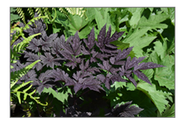
Pink Spike Bugbane foliage