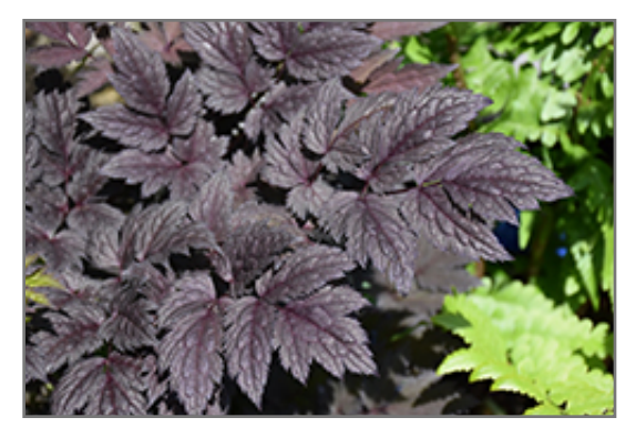
Pink Spike Bugbane foliage

Pink Spike Bugbane is recommended for the following landscape applications;