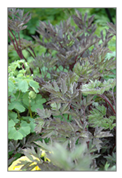
Hillside Black Beauty Bugbane

A native perennial presenting numerous spikes of fragrant, white flowers that are blushed with pink, in mid to late summer; contrasting dark purplish-black foliage; shelter from strong winds; perfect for a shady, woodland garden